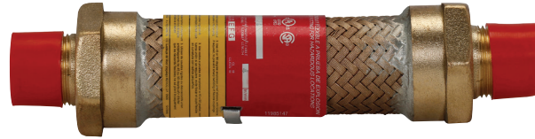
ECGJH (male connections at both ends) (shown furnished with protective caps)