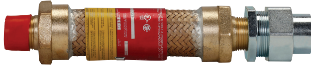
ECLK (ECGJH provided with UNF female union – male connection at one end, female connection at one end)

2 1/2" to 4" – stainless steel construction only